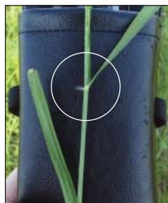
Teff grass stem showing species identifying ligule in the circle