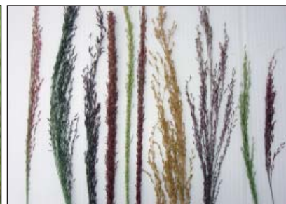
Teff grass panicles