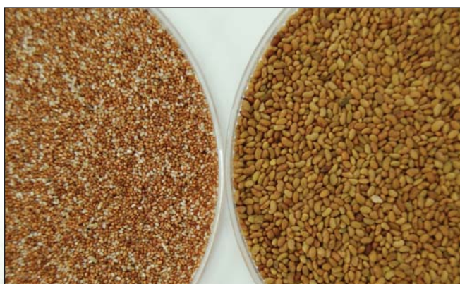
Raw Teff seed on the left at 1.3 million seeds per pound and alfalfa seed on the right with 220,000 seeds per pound.

Teff is a very small seeded annual grass with an average of 1.3 million seeds per pound. For this reason coated seed is usually preferred by growers so most planting equipment can handle Teff seed. Some seed coatings are now colored, which aids growers to visually check for coverage and depth of planting.