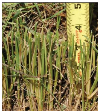
Proper cutting height

Cutting at the proper time (prior to seed head appearance) ensures adequate plant reserves for regrowth in subsequent cuts. Harvesting after Teff has headed out will cause delays in regrowth. Cutting interval is generally 45 to 50 days for first cut and approximately 30 days for subsequent cuts; however this may vary by location. A stubble cutting height of 3 to 4 inches is necessary to promote vigorous regrowth. Plant food reserves that fuel regrowth are stored in the bottom 4 inches of the plant stem, therefore cutting heights lower than 3 to 4 inches will severely reduce subsequent forage production. Windrows should not be left in field for extended times, or stand loss will occur under the windrows.