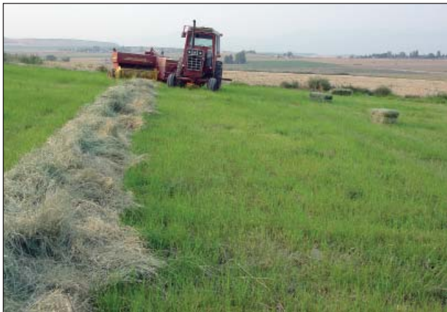
Windrows of Teff and note fast recovery after cutting

Harvest as dry hay will maximize forage production and return per acre. Hay making can be accomplished using normal harvest equipment for grass hay, however rotary mowers are preferred. Due to the fineness of its stems, Teff is one of the few annual forage crops that is suitable for making dry bales rather than having to ensile it. Windrows should not be left in the field for extended times since plants under the windrow may be damaged by delayed harvest.