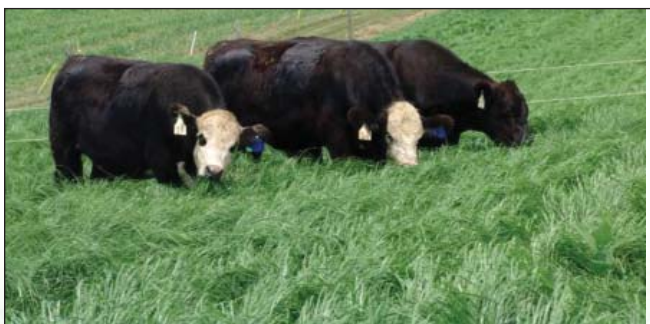
Cattle grazing in Teff

Grazing Teff planted in sandy soils may be more difficult than in heavier soils since plants are easier to pull out of sandy ground. In those cases, harvesting for hay might be advised in the early season and grazing after the last cutting. Prussic acid or nitrate toxicity in Teff forage has not been observed on late season grazing or after a frost.