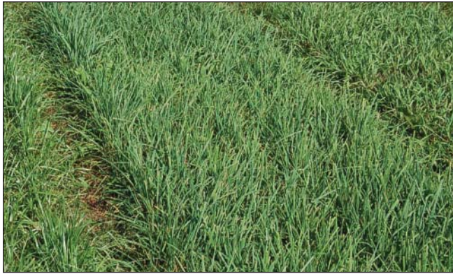
Seeding with no herbicide applied

If weed control is needed during stand establishment, several management practices can be useful. A pre-plant cultivation can be effective, especially if Teff is planted immediately after cultivation.