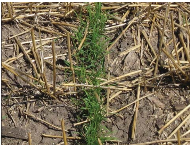
Teff seedlings in wheat stubble

Because Teff can be planted from late spring to mid-summer, it is a good double cropping option following cereal grain crops such as wheat. Teff hay has a higher profit potential than many alternatives due to its high yield and high quality.