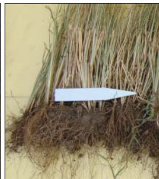
Dense fibrous roots