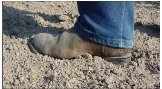
Improper seed bed preparation