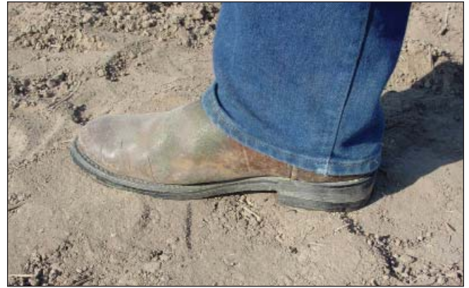
Proper seed bed preparation