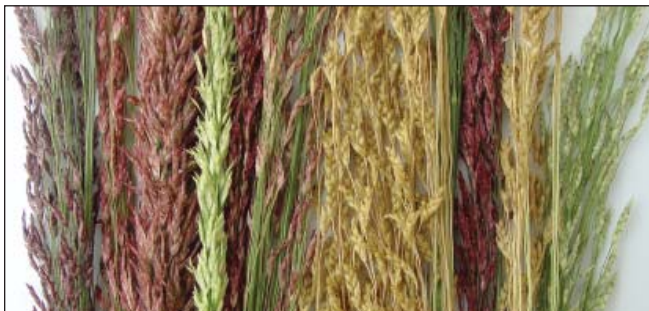
Teff seed heads showing the genetic diversity of the crop worldwide

The word "teff" is derived from the Ethio-Semitic root "tff", which means "lost", possibly a reference to its extremely small seed size.