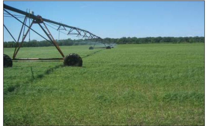
Teff under irrigation