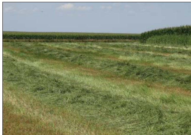
Windrows of Teff in corners of irrigated field

Farmers in irrigated areas using center pivots have been successful in utilizing Teff to obtain some production in the dryland corners. These plantings can be successful if there is adequate soil moisture at planting time for germination and establishment. Once established, Teff's low water requirement and subsequent drought tolerance has the potential of providing growers with additional hay production for on farm use or hay sales.