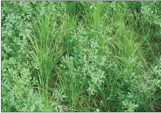
Teff interseeded into alfalfa